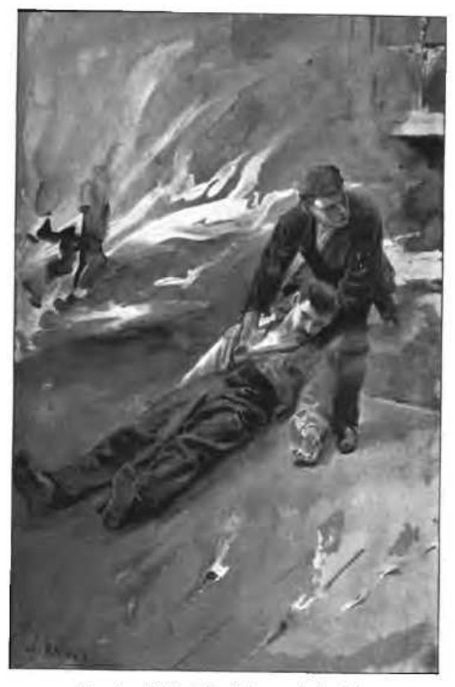
"Tom dragged Binks by the shoulders over to the window."