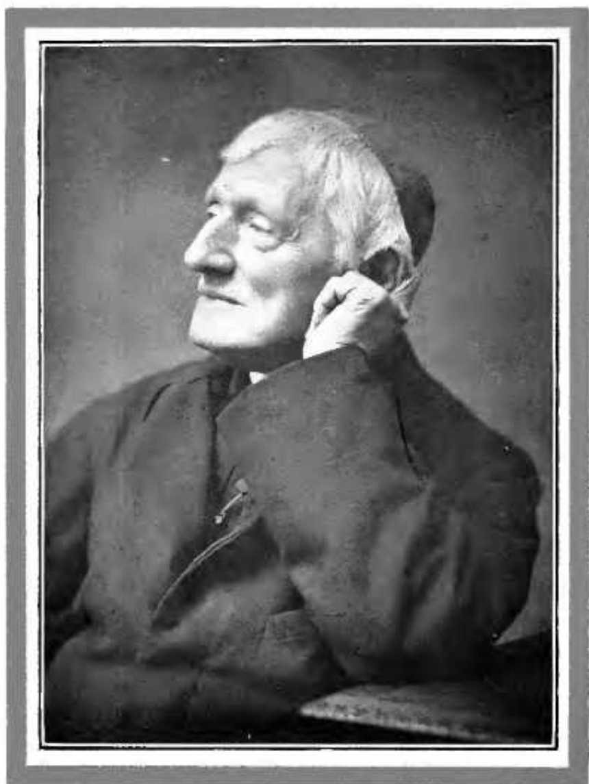
JOHN HENRY NEWMAN

Taken by Barraud shortly after his elevation to the Cardinalate