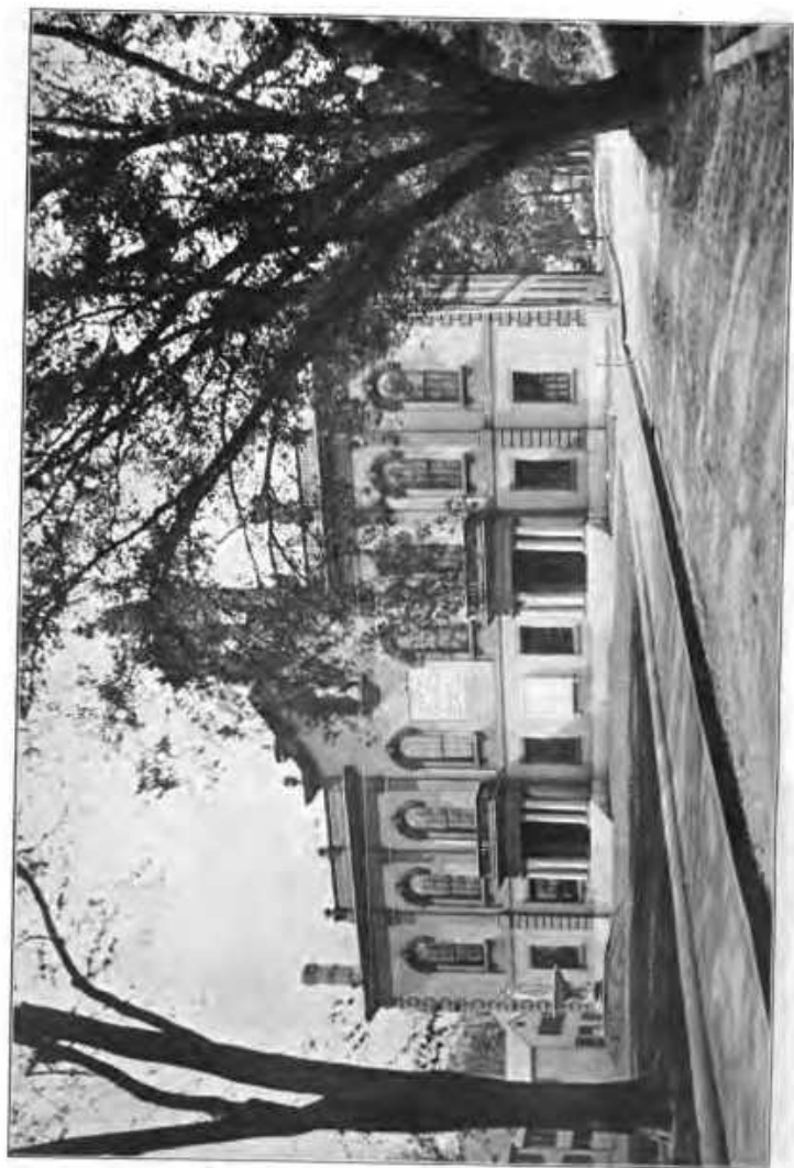
Court House, Plymouth.