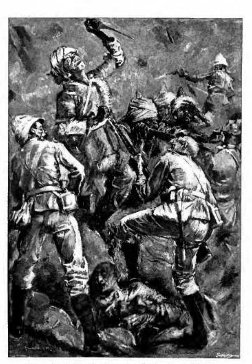
' He ran forward wid the Haymakers' Lift on his bay'nit.'— P. 10. Frontiplice.