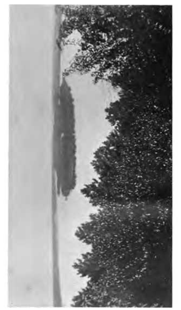
"The river's all a sparkle, an' the Towkead is all green." Page 11.