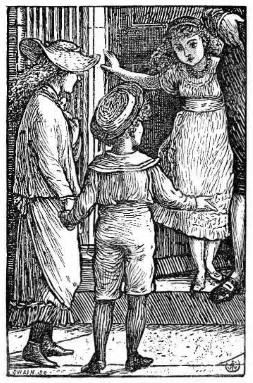
"It is Flossie and Me Sybil-Don't You Remember Us?"-Page 165.