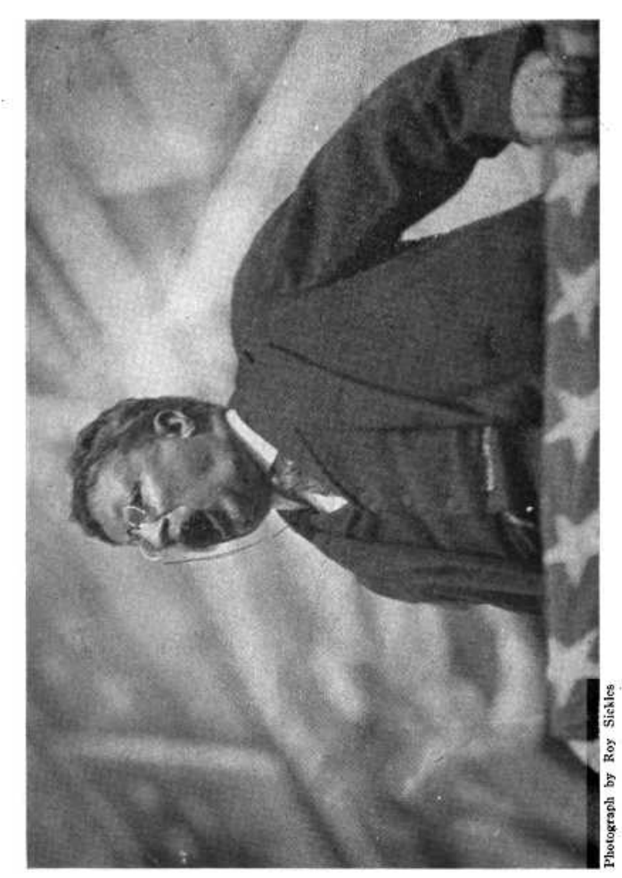
Colonel Roosevelt in Action at Lodi, New Jersey, May 23, 1912