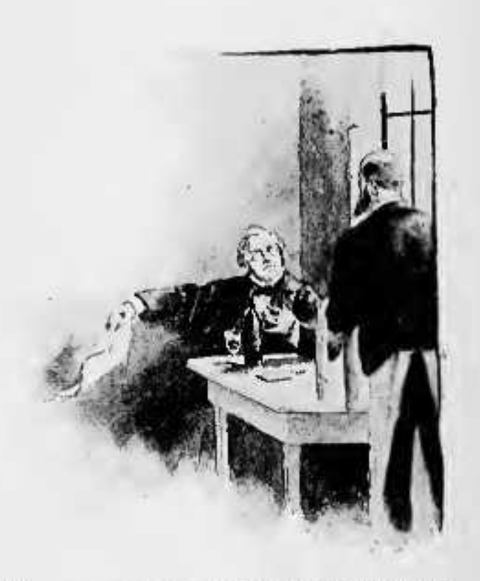
- A computed, correspondence, 1 me and white for Boutless excess . Page 56.