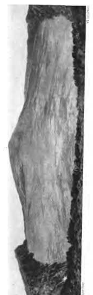
FROM THE PAS OF RELIEDOPISE. THE VOLCANO.