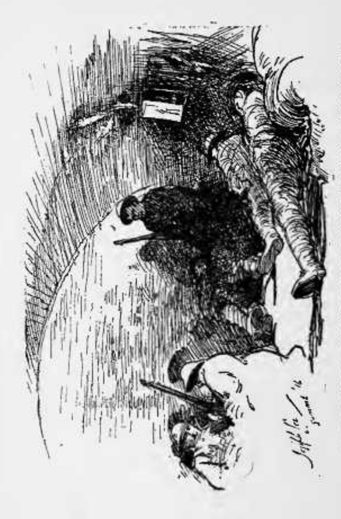
SOLDIERS SHELTERING IN A CELLAR DURING A HEAVY BOMBARDMENT