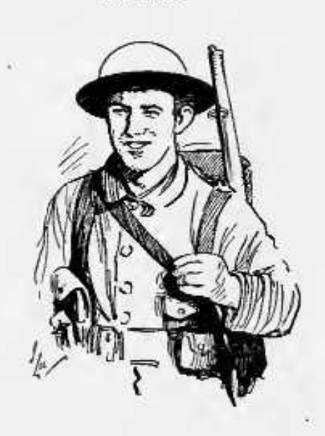
DEDICATED TO HIM:---