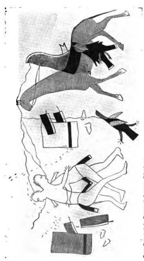
EARLY INDIAN DRAWING SHOWING A WRISTLING BOUT FOR A TURKEY. The Donor, a Hunter, is the Shrouded Figure on the Horse. From Report of the Bureau of American Ethnology.