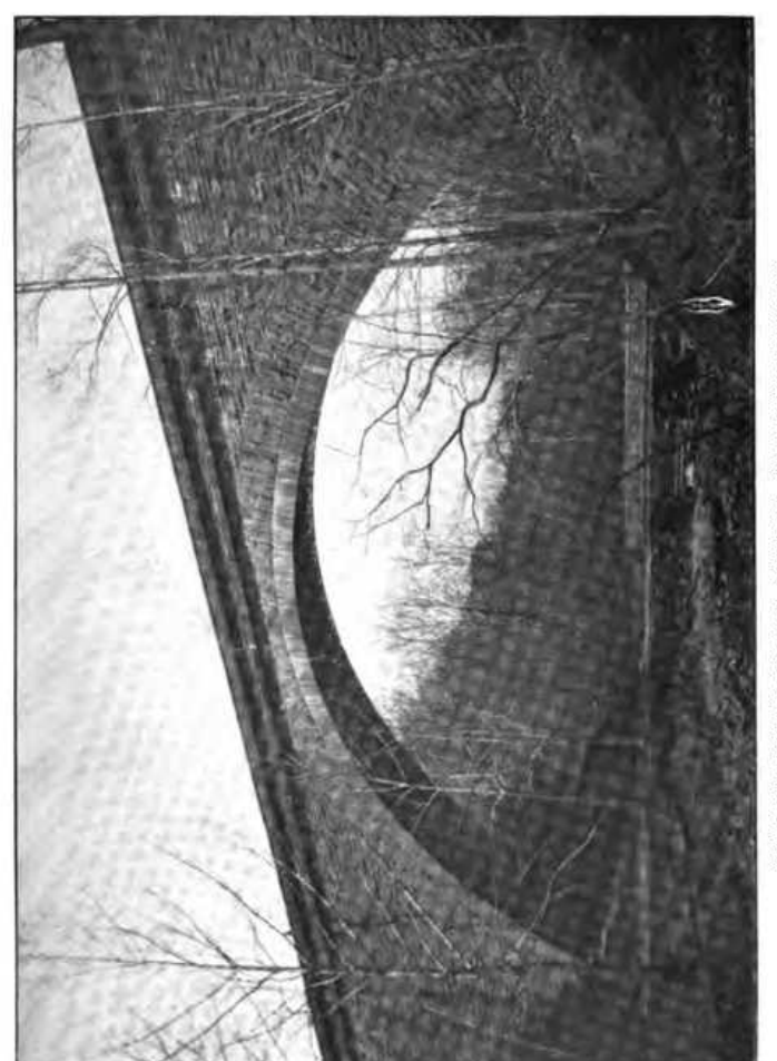
THE CABIN JOHN BRIDGE AND AQUEDUCT, NEAR WASHINGTON, D. C.