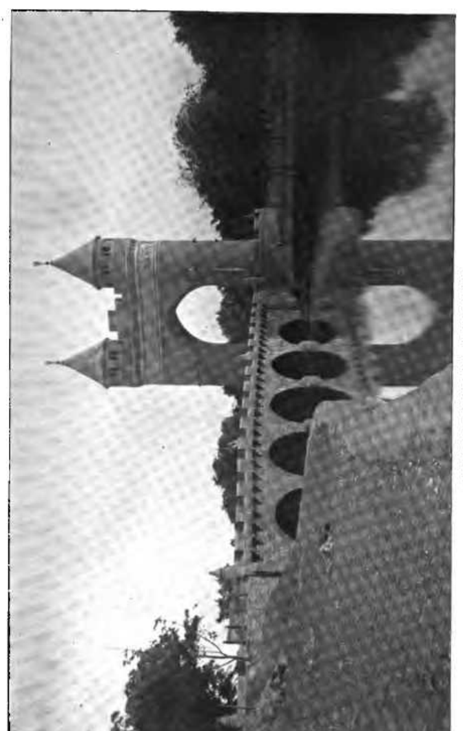
MEMORIAL BRIDGE AND ARCH, HARTFORD, CONN