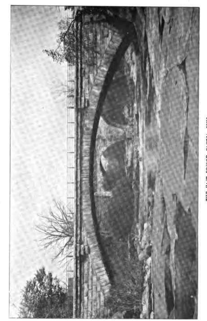
THE EAST RRIDGE, ELYRIA, OHIO.