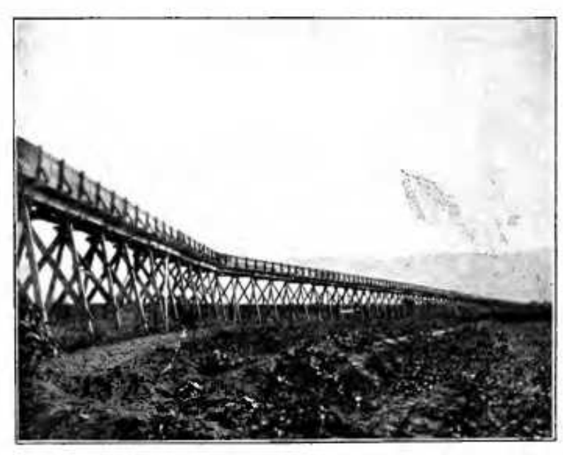
HERIGATION FLUME, FORT ROMIE.