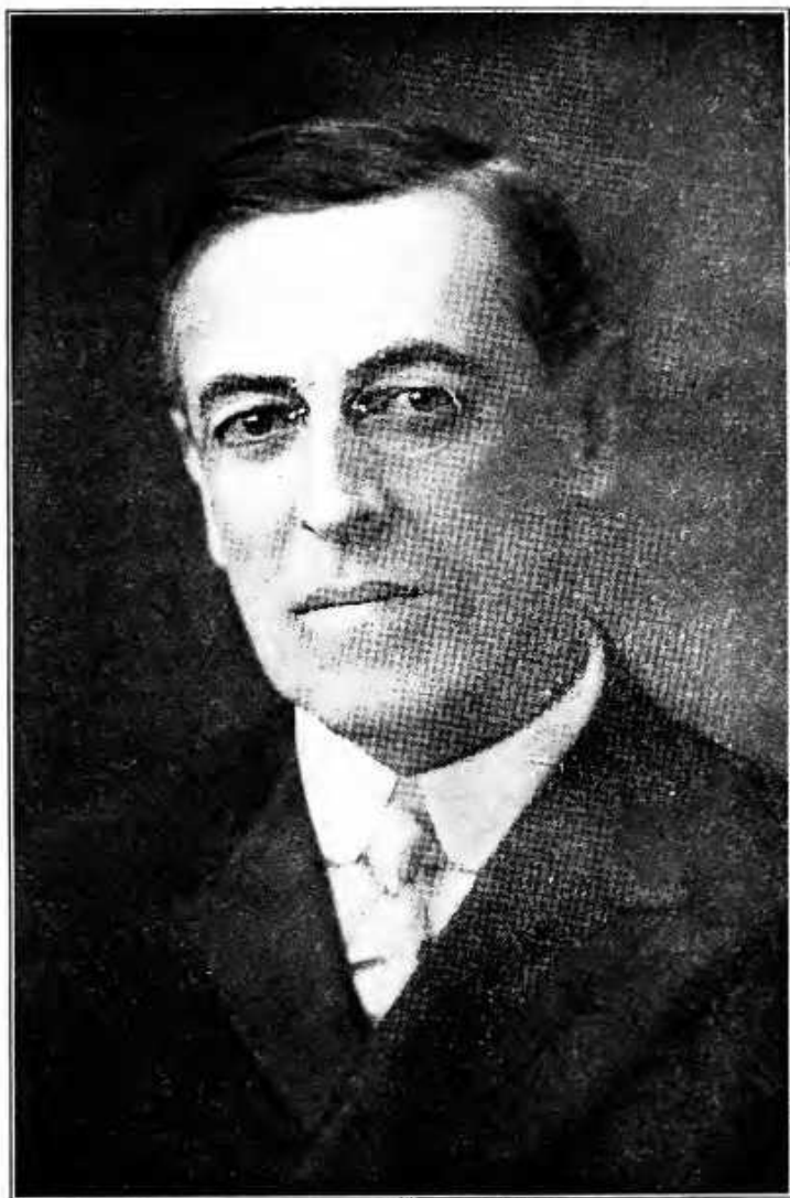
PRESIDENT WOODROW WILSON THE MAN OF DESTINY TO MAKE THE WORLD SAFE FOR DEMOCRACY