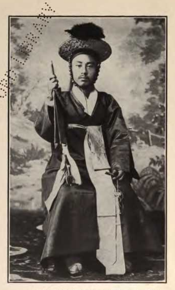
A KOREAN OFFICER OF THE OLD ARMY