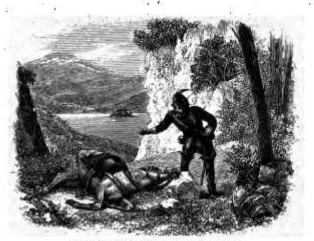
Woe worth the chase, we worth the day. That cost thy life, my gullant gray!