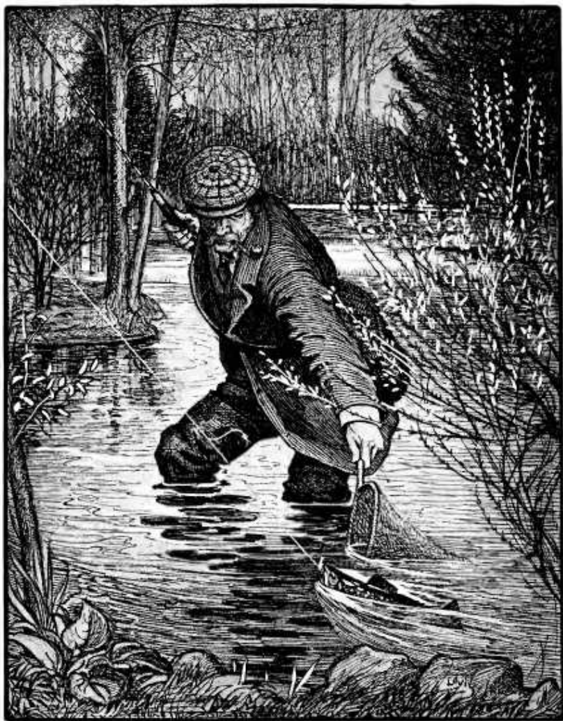
When the pussy-willows bloom