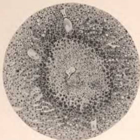
Experimental focal cell necrosis in the liver of the Guinea pig. Ricin intoxication.