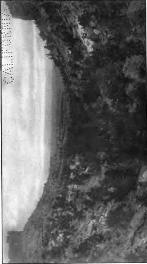
"San Anton Pass," Continental Divide, Looking Northwest.