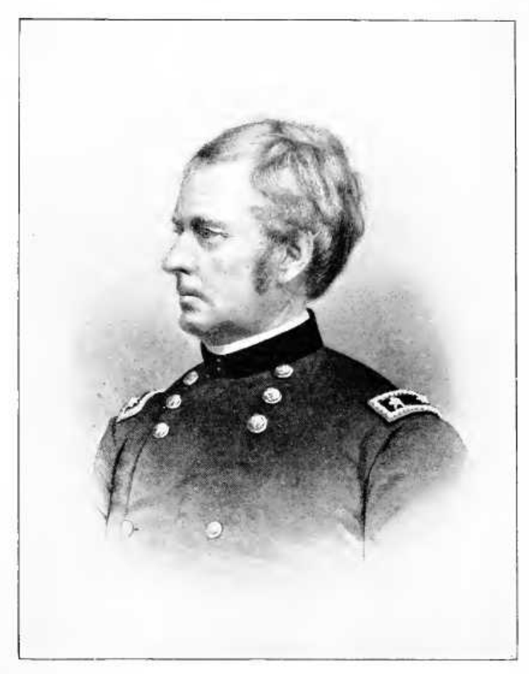
MAJOR GENERAL JOSEPH HOOKER, U. S. A.