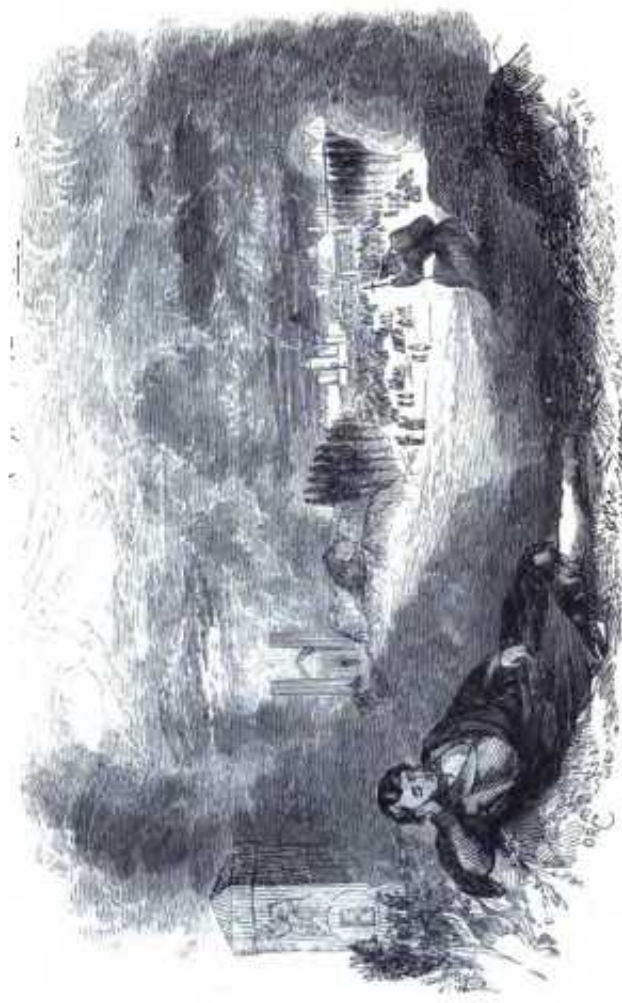
41 Enter ye in at the strait gate, for wide is the gate, and broad is the way, that leadeth to destruction, and many there be which go in thereat.—Because strait is the gate and narrow is the way, that leadeth unto life, and few there be which find it.'—MATTHEW vii. 13, 14.