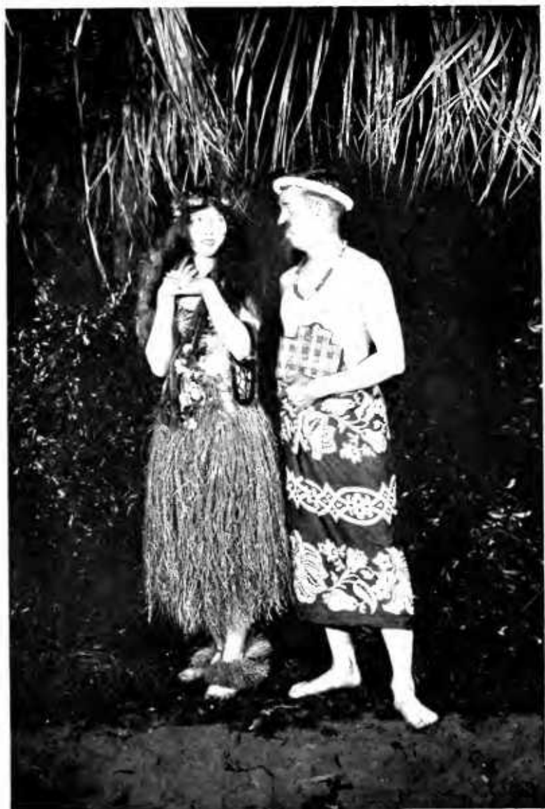
The Author and His Island Bride