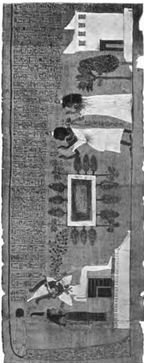
Scene from the Papyrus of Nakht, showing the deceased and his wife worshipping Osiris in the Other World, and the manner of the houses in which they expected to live, and their vineyard and garden with its lake of water. (British Museum, No. 10,471, sheet 21.)