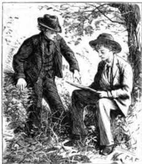
IN THE ARTIST'S MOOD. Page 49.

Thomas Nelson and Sons, LONDON, EDINBURGH, AND NEW YORK.