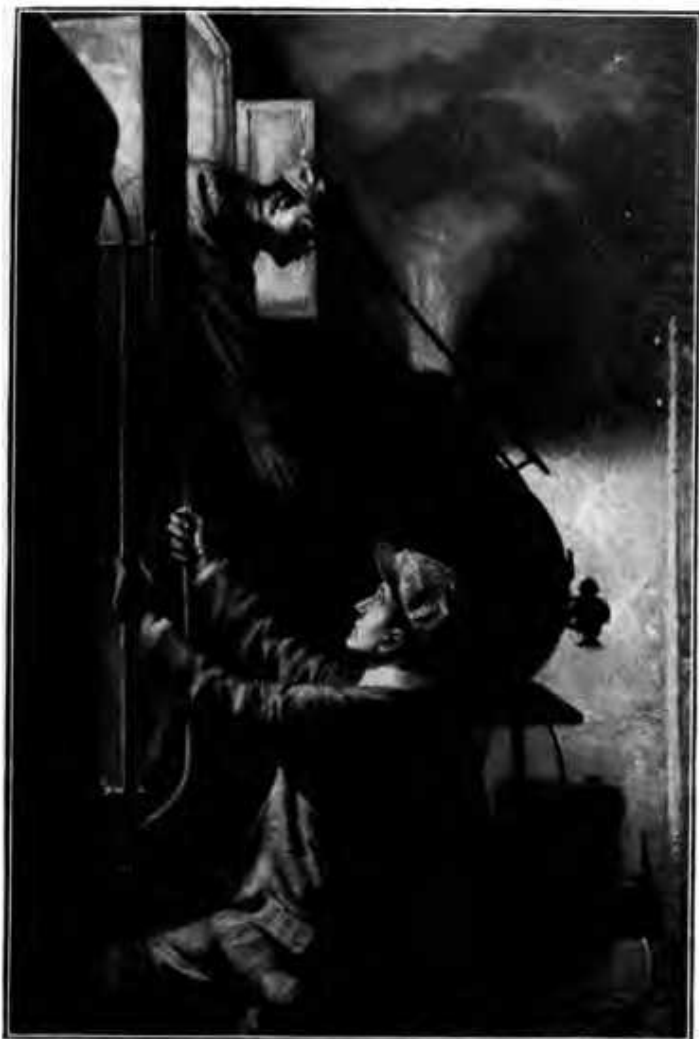
"GET OFF THAT STEP, OR I'LL PUT YOU OFF!"—Page 50