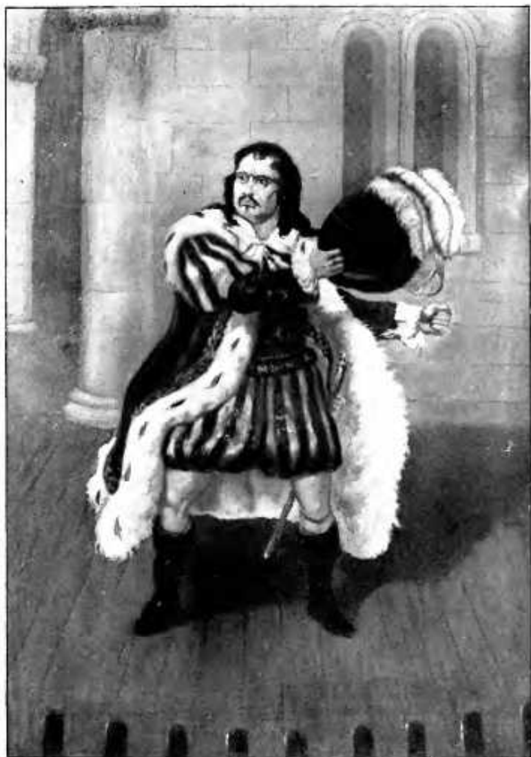
JUNIUS BRUTUS BOOTH AS KING RICHARD III.