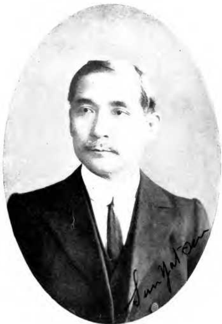
SUN YAT SEN With Autograph