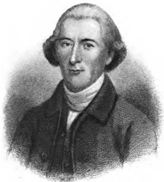
CHARLES THOMSON SECRETARY OF THE CONTINENTAL CONGRESS