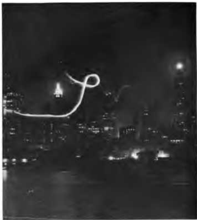
Looping the loop above New York