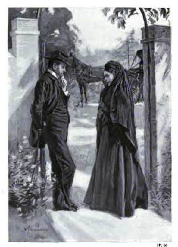
"'I'M MIGHTY GLAD YOU'VE SPOKE'"