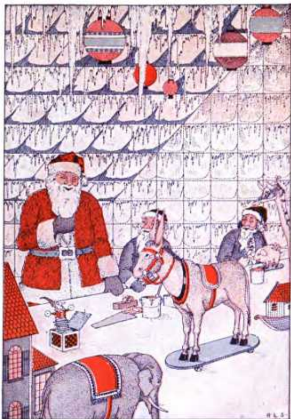
The Nodding Donkey's First Appearance. Frontispiece—(Page 2)