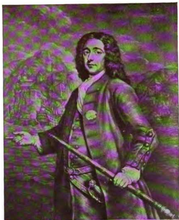
The Hon. ble Edward Vernon Esq. Vice Admiral of the Blue. And Commander in Chief of all His Majesty's Ships in the WEST-INDIES.