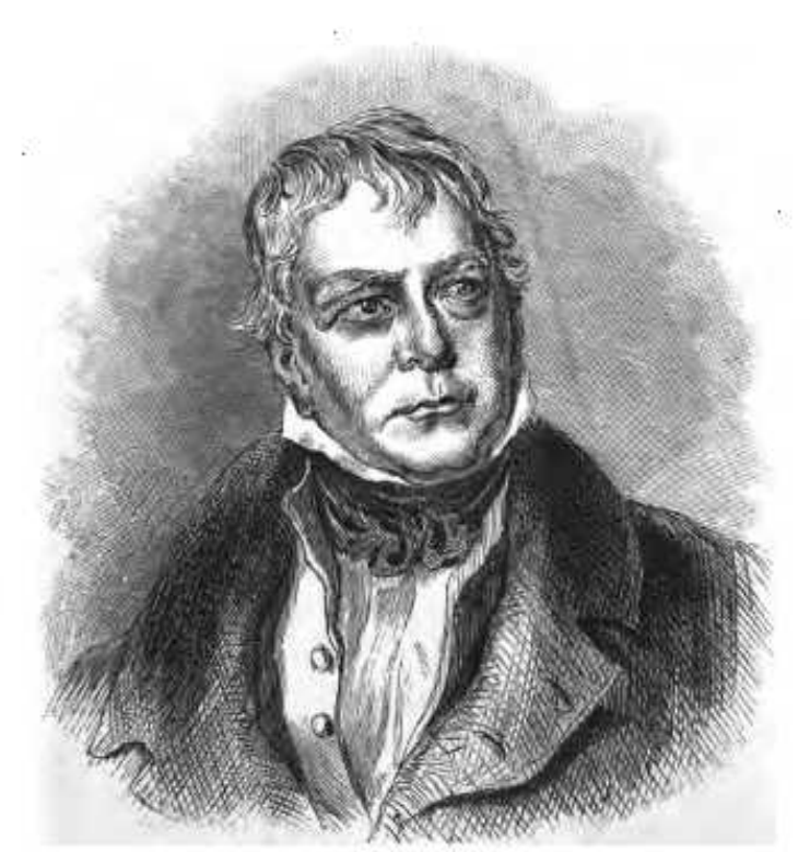
SIR WALTER SCOTT.