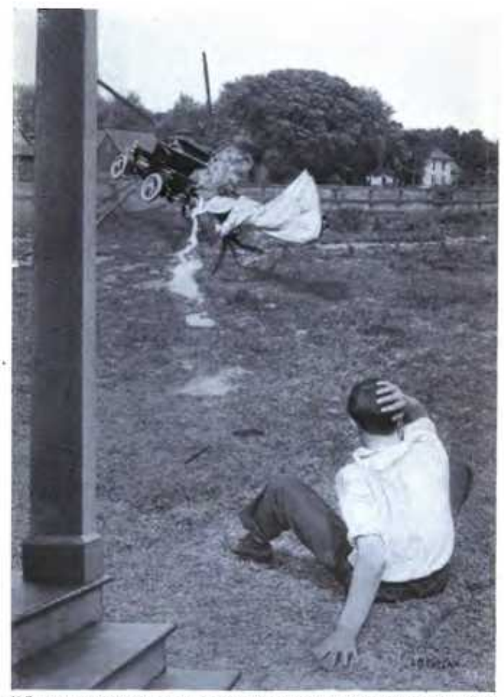
"I saw then that I had not thoroughly domesticated my automobile"