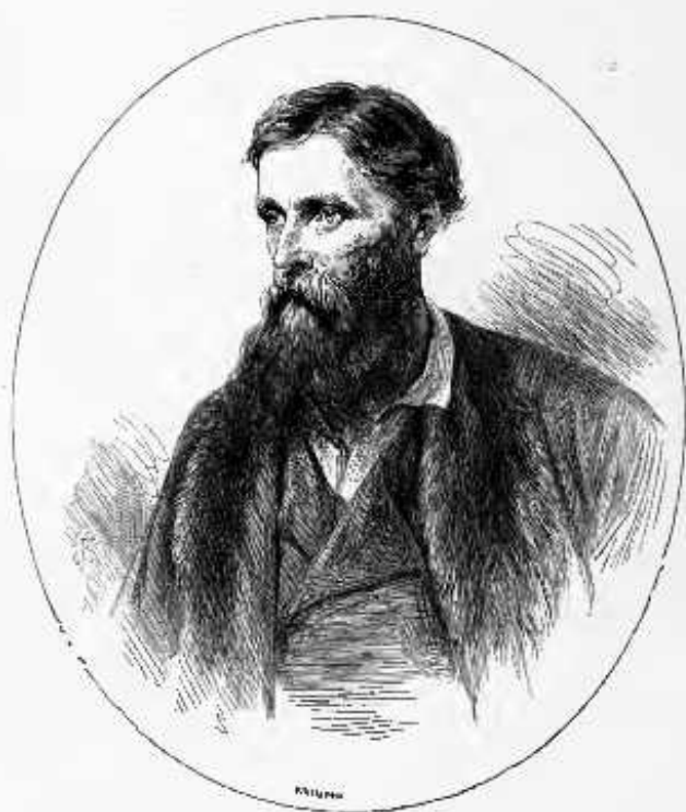
HENRY BROCGHAM LOCH,