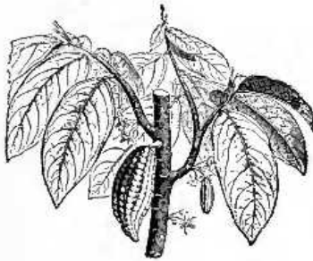
THE FRUITING-STEM OF A CHOCOLATE-PLANT, THE FLOWERS, YOUNG FRUIT, AND RIPENED POD ALL SPRINGING FROM THE OLDER WOOD.

DORCHESTER, MASS. : WALTER BAKER AND COMPANY.