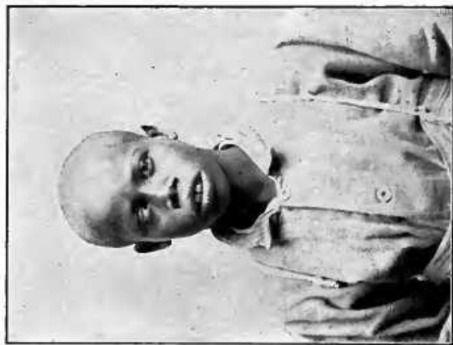
IS IT THE RIGHT EYE?