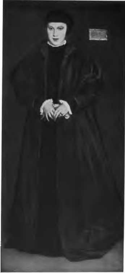
CHRISTINA, DUCHESS OF MILAN BOHEM NATIONAL GALLERY, LONDON