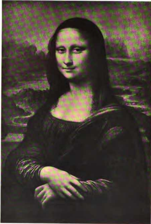
MONA LISA LEONARDO DA VINCI LOUVRE, PARIS