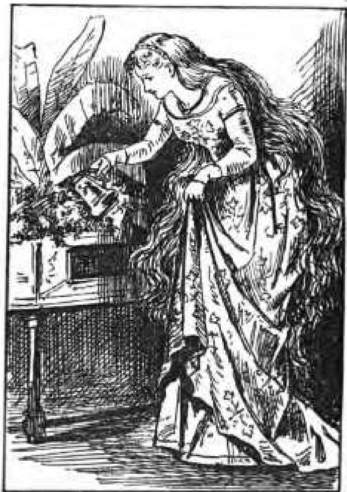
"A lady . . . Tended the garden from morn to even."