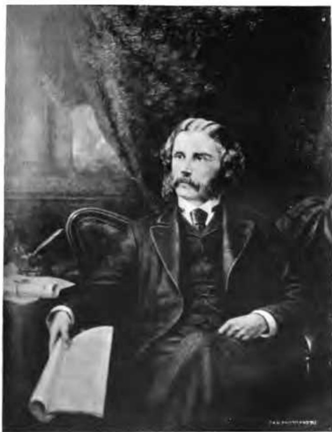
THE LATE WILLIAM A. FOSTER, Q. C.

From a painting by Wm. CUTTS, Esq., the property of the National Club.