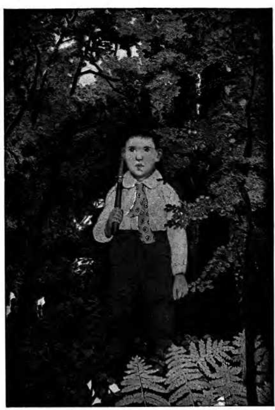
"Wunst they wuz a little boy went out in the woods to shoot a bear"