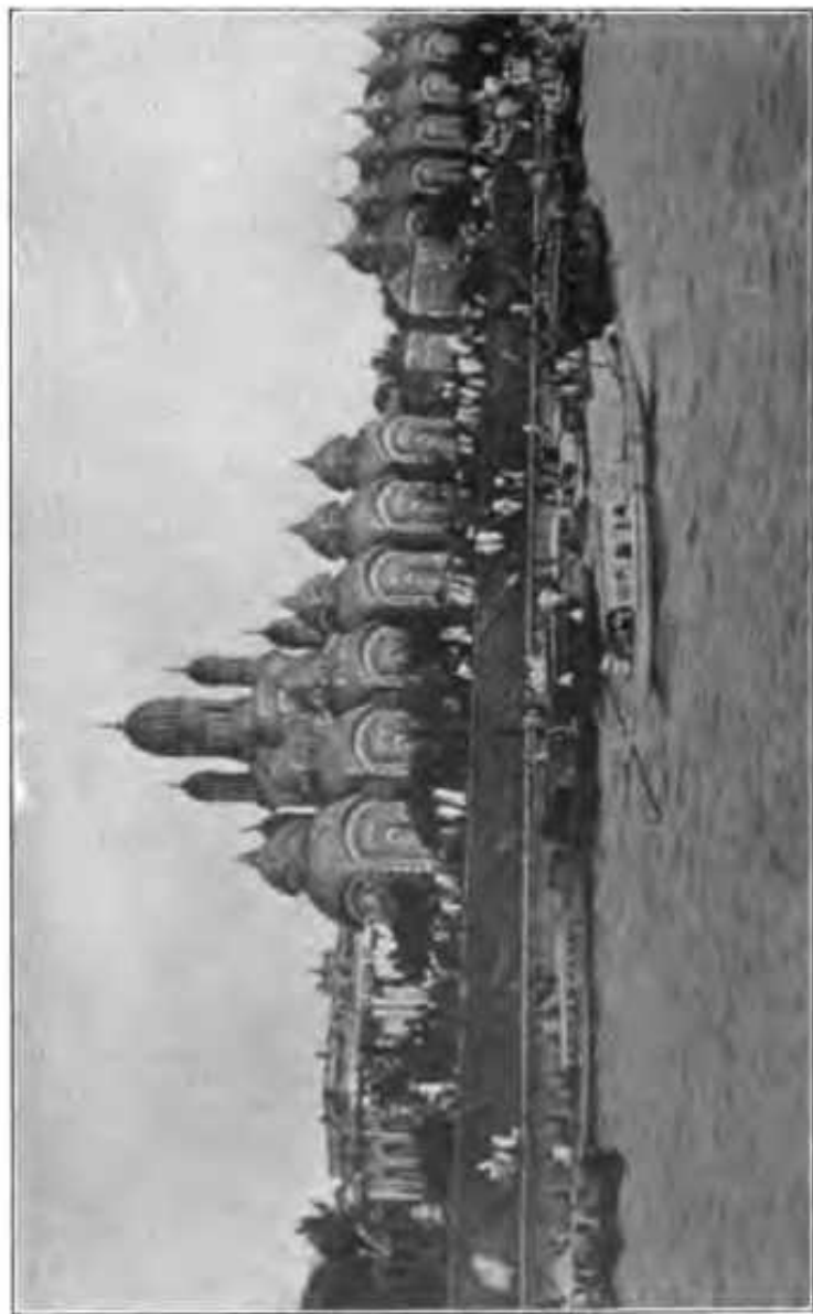
TEMPLE AT DAKSHINESWARA ABOUT FOUR MILES NORTH OF CALCUTTA, INDIA.