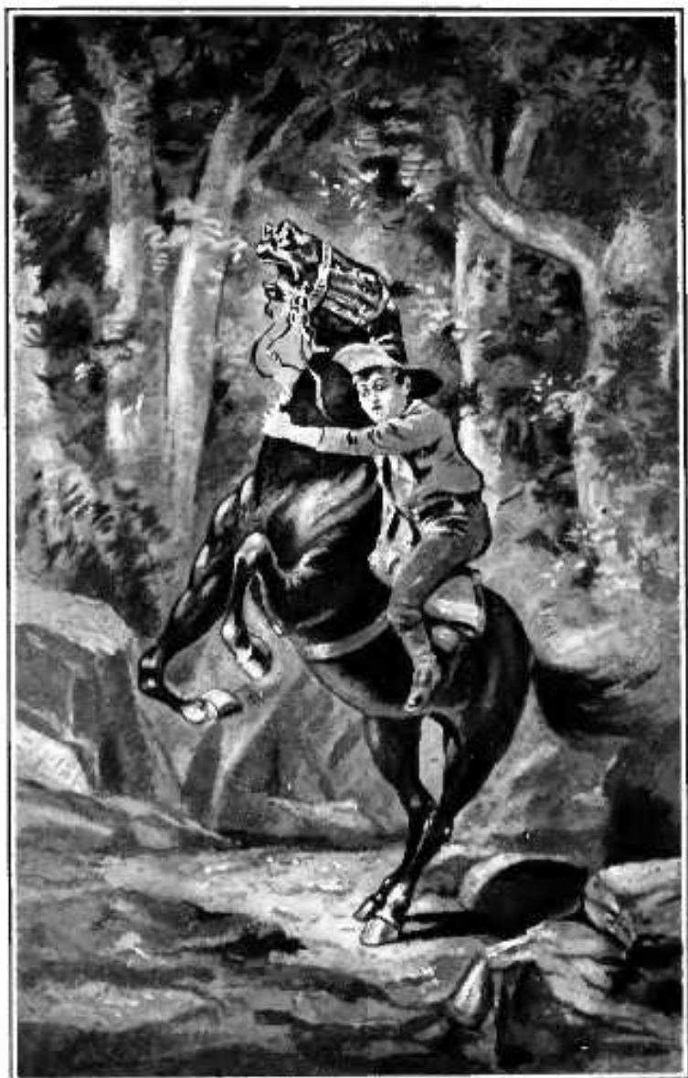
The youth had to cling fast around his neck to save himself a lot of broken bones"