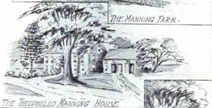
THE THEOPHILUS MANNING HOUSE