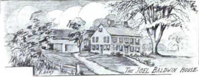
THE JOEL BALDWIN HOUSE.