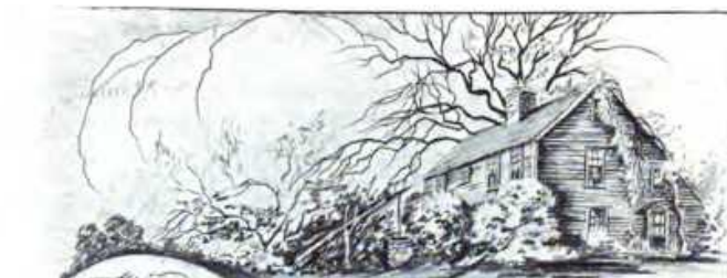
THE MANNING MANSE