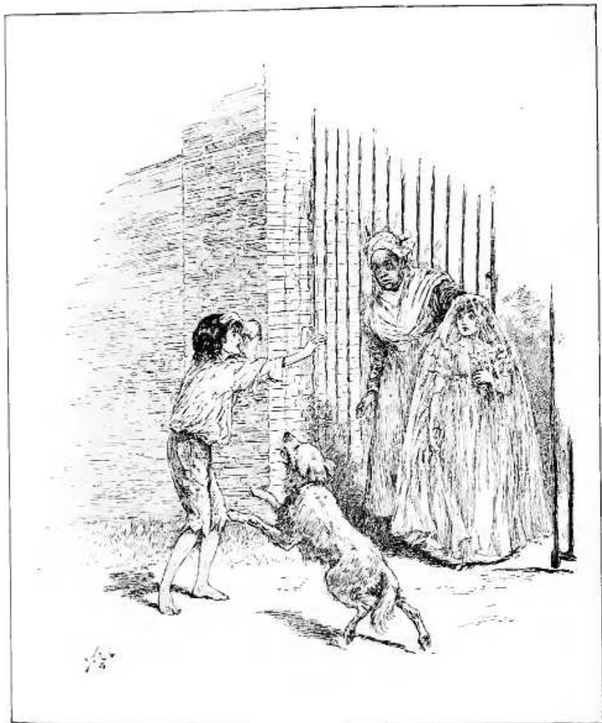
"HE CRIED, 'DEA! SELINE!' AND FELL FREELY FORWARD." (SEE PAGE 215.)