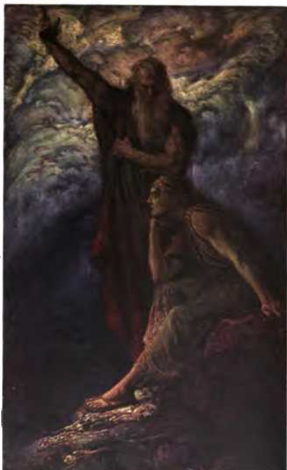
From a Painting by Sigmund de Ivanovitch