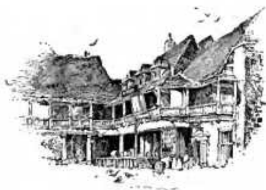
THE TABARD INN