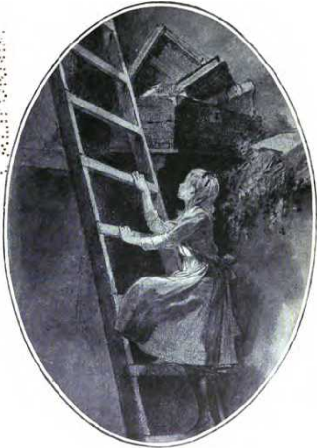
UP THE LADDER TO THE SCUTTLE ( Page 160 )