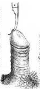
Division of Organs by curved bistoury.