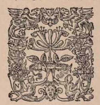
Printed for Nicholas Linge.

Non aliena meo pressi pede | si propius stes Te capient magis | o decies repetita placebunt.